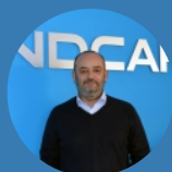
Fabio Pannoli INDCAR Italia

Ideal for downtown narrow streets. A very functional, price-contained, reliable vehicle. Front and rear low floor entrance for easy WCHR access. Available in multiple approved interior layouts. Capacity: up to 18 + 11 SP + D or 16 + 10 SP + 1 WH+ D. Two service doors for easy access. Standard features: 2 service doors · Front, rear and sides paneling made out of Composites · Low floor front and rear entrance · Air conditioning for passengers · Heating system · Multiplex (MUX) bodywork control system · Tinted side windows. Options: Large list of available options to allow customization of interior and exterior.